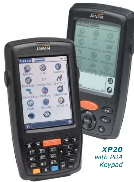
XP20 with PDA Keypad

The XP30 is the world's first fully-featured mobile computer that scans barcodes and runs the latest version of the Palm OS. A brilliant, color, quarter-VGA display and blazing Freescale™ architecture make the XP30 a best-of-breed, rugged, barcode scanning, mobile computer, while its list price makes it impossible to ignore. For customers who want to extend the reach and capability of their mobile Palm applications, the XP30 has the horsepower to execute mission-critical data collection tasks at the point of business activity. And for customers who are ready to switch to the Palm OS for its simplicity and its durability, the XP30 is a platform that pays for itself twice as fast as comparable devices.